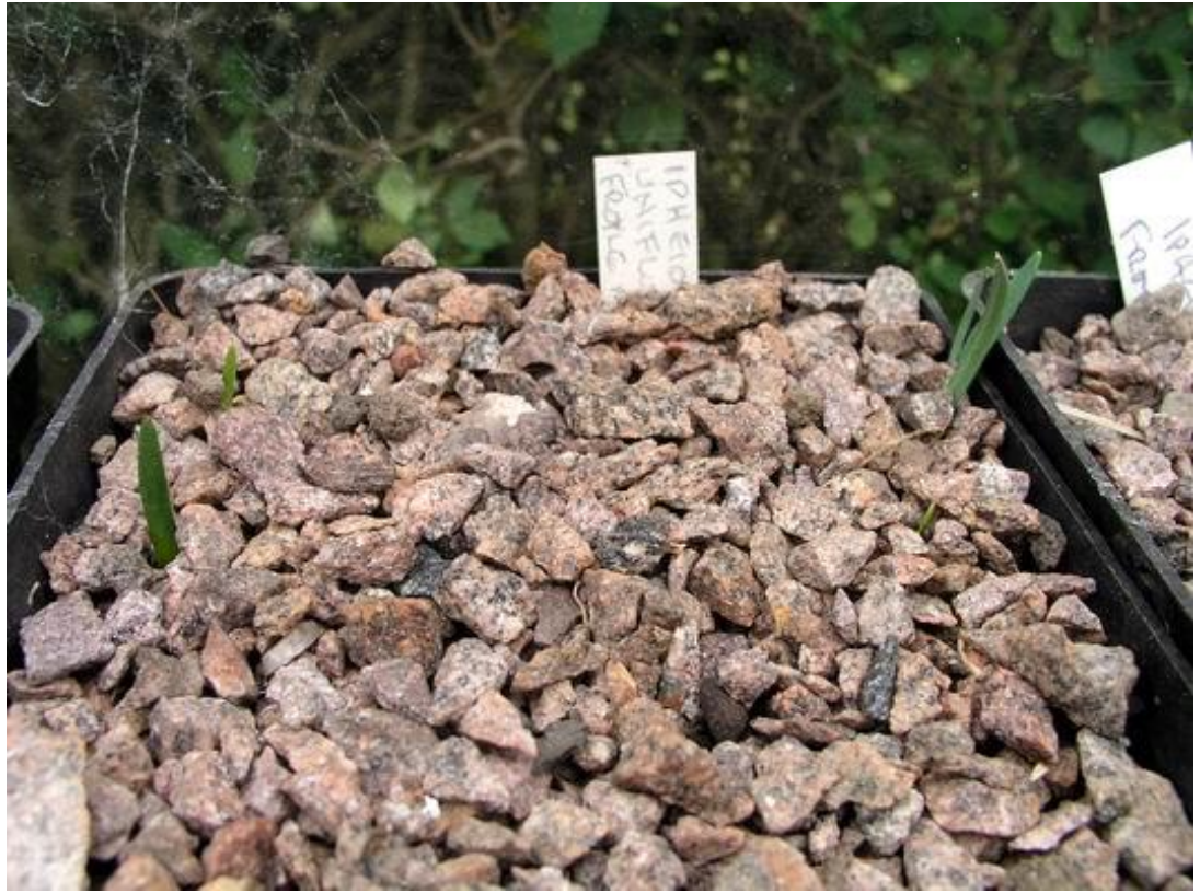
Ipheion 'Froyle Mill'

Narcissus bulbs start off by sending out exploratory roots to search for moisture as well as extending their shoots. These bulbs were stored in a bag of dry sand in the potting shed and again the only moisture present was that contained in the bulbs themselves. Their internal clock is telling them it is time to start to grow. As I mentioned last week it is the falling temperatures that stimulate this growth and in hotter areas it could be too early yet to apply water.