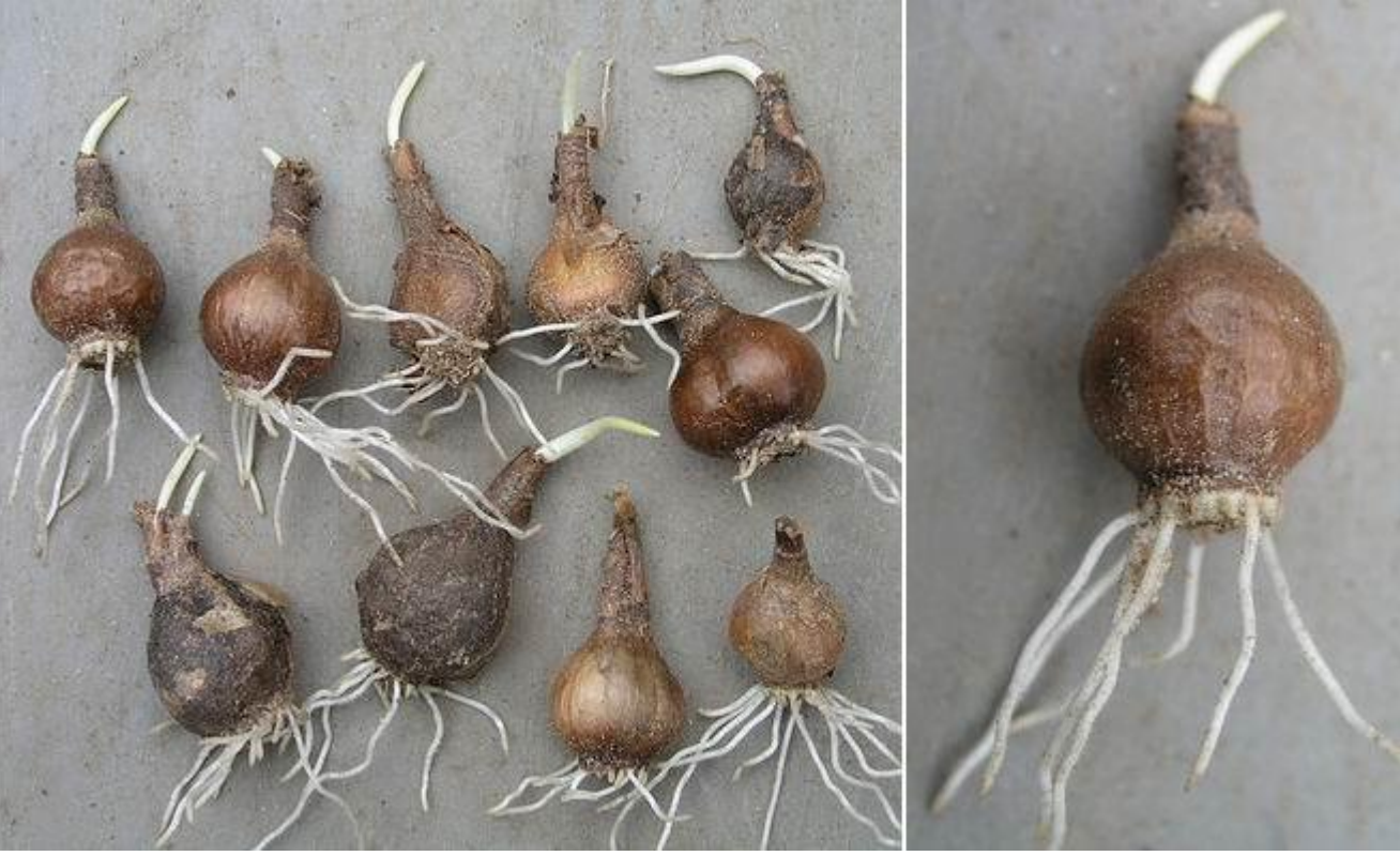
Narcissus bulbs with roots

I found these Tropaeolum tricolorum (tricolor) corms sprouting from a paper bag in my potting shed. Despite not being planted and not having any water they are wanting to grow - how do they know? This has long puzzled me and I am still not convinced that I have the complete answer but I know that falling temperatures is part of the equation. In the case of the Tropaeolum, it is the shoot that starts to grow first, using the energy stored in the tuber.