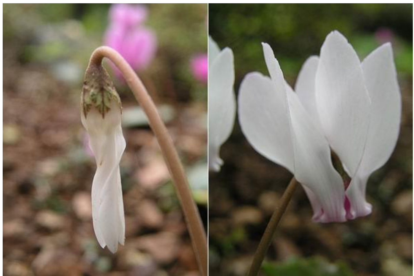
Cyclamen flower and bud

One of the best of the checkered colchicums to grow is Colchicum agrippinum which also has the benefit of having relatively small leaves and so it is useful for the rock garden while the other large flowered species need a bit more room for their leaves to grow.