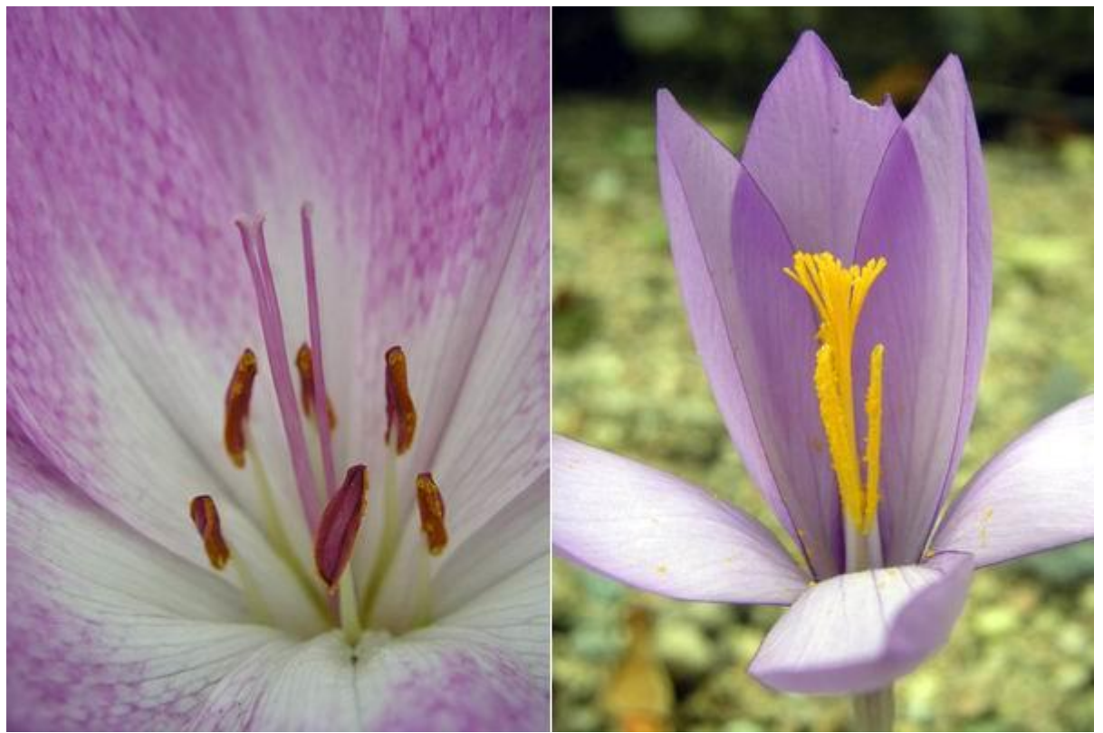
Colchicum and Crocus

Colchicums are often called 'autumn crocuses' in the UK and this confuses many people as they are not even close to a crocus. Colchicums (poisonous in all parts) are in the family Liliaceae while crocus come from the Iridaceae. A quick and reliable way to know the difference is to count the stamens, the bits that have the pollen on. Colchicums, above left, like all lilies, have six while crocus, right, have three, just like an iris.